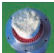
This Technology Features Advanced HiFluxx Fiber!

Typical applications include: LC/MS, nebulizer gas, chemical and solvent evaporation, instrument purge and supply, evaporative light scattering detector use (ELSD), and sparging.